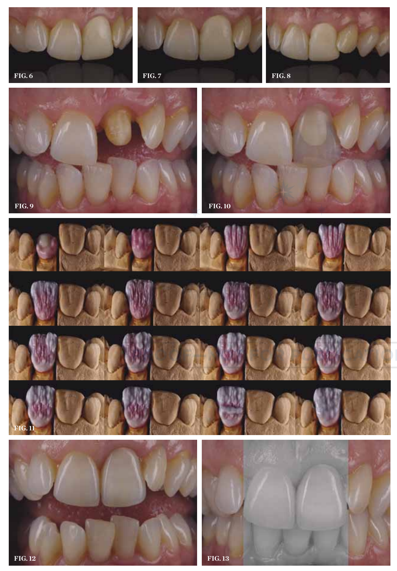
SHADE MATCHING (6 THROUGH 8.) Images shot with the paper diffuser technique. The colors in the dentition become more apparent against a black contrast. (9. AND 10.) An understanding of the abutment is also necessary when planning on material selection. In this case, GC Initial™ alumina ceramic (GC America, www.gcamerica.com) was chosen do to the substrate. (11.) A polychromatic layering scheme is carried out with GC Initial alumina ceramics. It is only from good shade images that the technician can apply his or her knowledge of ceramics. (12.) The final restoration at try-in. (13.) The value matched, which is the most important characteristic when it comes to a shade match.

laboratory. First, the original image is kept intact and untouched. The image is duplicated four times to create more useful information for fabricating the restoration (Figure 2 through Figure 5). The second image is converted to black and white to double check that the value is accurate. The third image is saturated with contrast to "pull" out the colors of the teeth to see where ceramics should be layered. By saturating the image, the colors in the teeth become more vivid and the technician can use his knowledge of polychromatic layering to apply different colors of ceramic where he sees different colors in the teeth. The fourth image is inverted to see line angles and light reflections more accurately. A good understanding of dental ceramics is required when saturating the teeth. The technician should have all of his shades in the ceramic kit fired in the calibrated oven in order to understand color control and how it can be applied to the image. These tabs can also be sent to the dentist for custom shades.