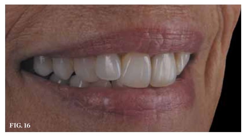
FINAL RESULTS (14. THROUGH 16.) The case at 6 months blends harmoniously with the surrounding dentition.